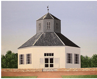
Vereins Kirche: The first Public School in Gillespie County.