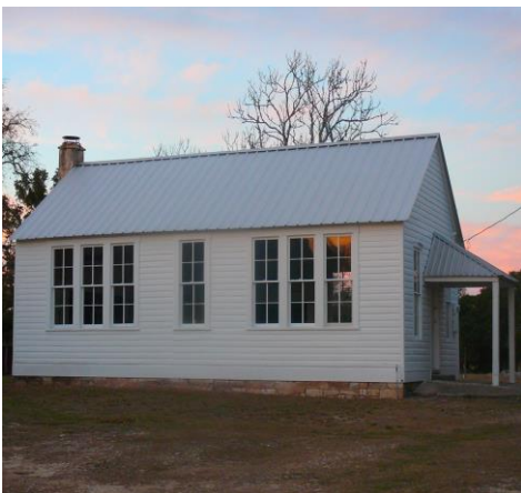
NEW PAINT INSIDE AND OUTSIDE AT RHEINGOLD SCHOOL-Looks great!

TWELVE Gillespie County Country Schools are now listed on the CSAA National Schoolhouse Registry and display CSAA markers to identify these school buildings as historical, architecturally significant, and to recognize their preservation achievements. Markers on these schools: Lower South Grape Creek, Rheingold, Pecan Creek, Cherry Spring, Williams Creek, Cave Creek , White Oak at Pioneer Museum, Vereins Kirche, Wrede, Crabapple, Willow City School, and Zion Lutheran School. Our goal is to have all our country schools on the CSAA Registry.