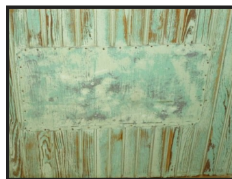
Crabapple School Teacherage US Postal Drop

Petersburg School served as a postal drop. The Crabapple School Teacherage was a US Post Office. Did other schools handle the US Mail?