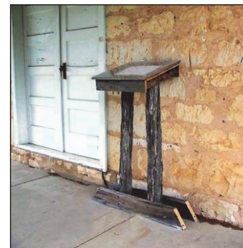
Crabapple School register at outside door for visitors

Use the Friends of Gillespie County Country Schools brochure map or go to www.historicschools.org for our brochure map. Select a school and drive out for an up-close look at the school-house, the BBQ, the playground, school yard and beautiful countryside. Please be sure and register while there.