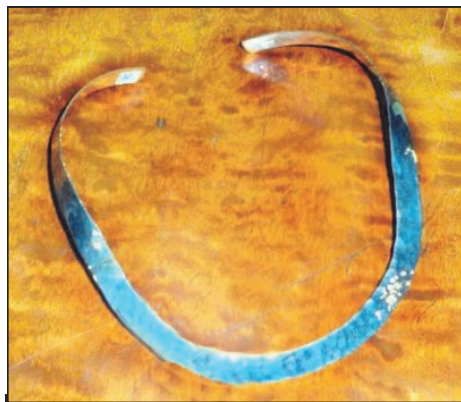
Raffle Item : Handmade Hammered Sterling Designer Necklace: Value: Over $100